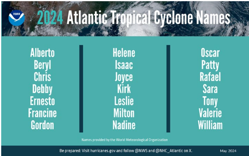
alphabetical list of the 2024 Atlantic tropical cyclone names as selected by the World Meteorological Organization.

For 2024 the following names are given to the storms: